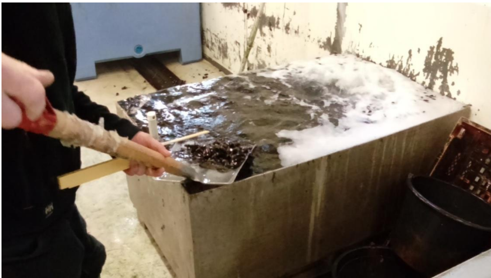
Figure 2. Mussels from the depuration facility at Rissa.

It also has to be mentioned that mussels were collected in 2016, only in Tromsø and Trondheim as a pilot experience (more detailed in Deliverable 3.3), and in 2017 in all the sampling sites shown in Table 1. In addition, farmed mussels from a depuration facility located in Rissa were collected in 2016 (Figure 2).